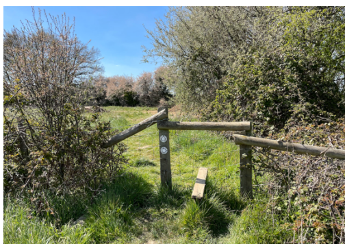
The stile before you need to concentrate!

Continue straight ahead through a field of crops, through a gate and to a stile at the far end. This next section is not clearly marked.