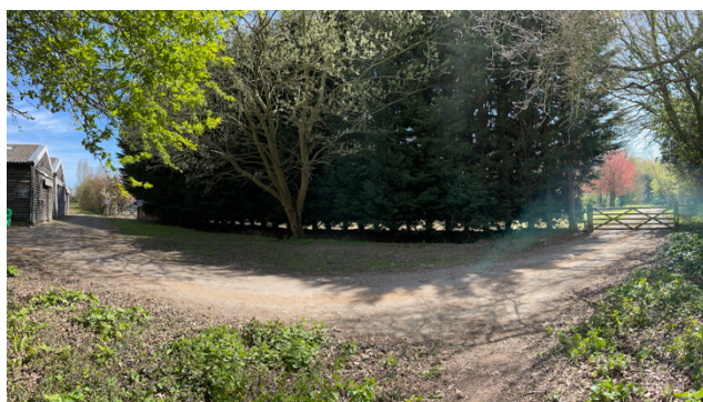
The gate which has a stile attached to it on the left.