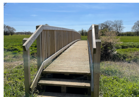
Footbridge over the Beult

Continue ahead where you will see the industrial estate. The footpath takes you along the fence line of the industrial estate. You then reach this bridge: