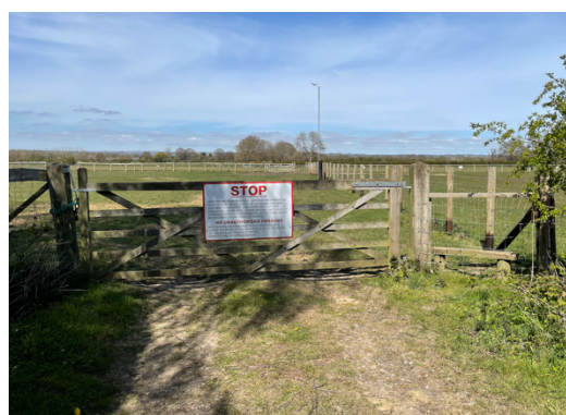
Gate and warning sign, with stile to your right