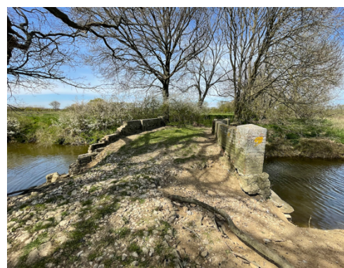
Old bridge after walking through the field