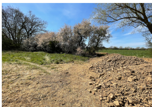
You can see the path veering off to the left

Continue ahead and then you might see the path veer off to your left, and an entrance to a another field straight ahead. Take the path veering off to the left. Continue and you'll see some barns on the left and a gate which looks like private property. It is, but the footpath runs through it. Look carefully at the large gate and you should see there is a stile attached to the gate on the left. Cross over it, staying on the drive, then you'll see a gate to your right to exit the property. This is now footpath KH603.