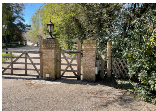
The second gate where you exit this property.

You then take the lane to your left, taking you to Waterman Quarter. Continue along this lane (Bletchenden Road) towards the A274 and then CAREFULLY cross to Shenley Road. Continue to the main Aerodrome entrance which is roughly 500m on your left, passing the Veterinary practice on your left.