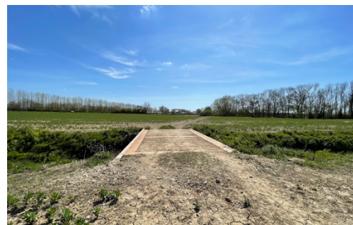
Footbridge in the middle of the field

This is footpath KH602. According to the footpath map the path follows the line of the railway, passing through a gate before veering off to the right through a field. Clearly an informal route through the wooded disused railway is more popular and well-trodden. Using that route you simply re-join the path in the middle of the field to your left, crossing over the footbridge shown below: